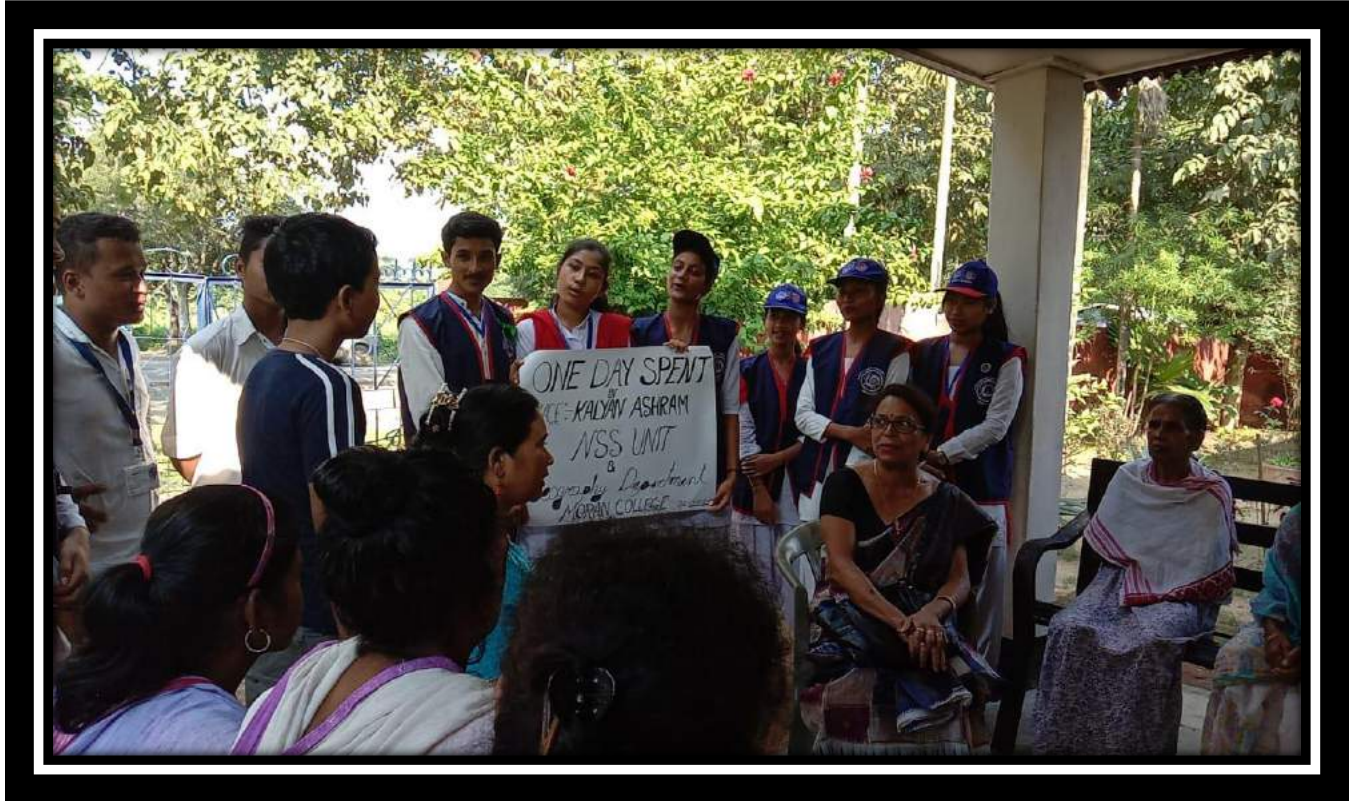
affectionate.Around 16 volunteers participated in this programme.IMG-20191003-WA0000.jpg