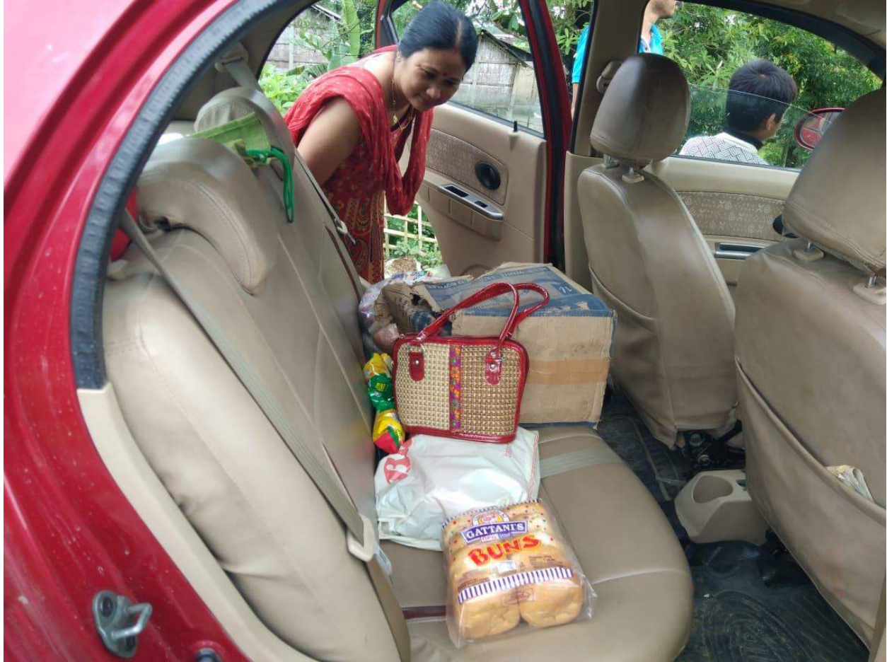
29. Cleaning Campus on 1.8.2019 (Swacch Pokhoda)