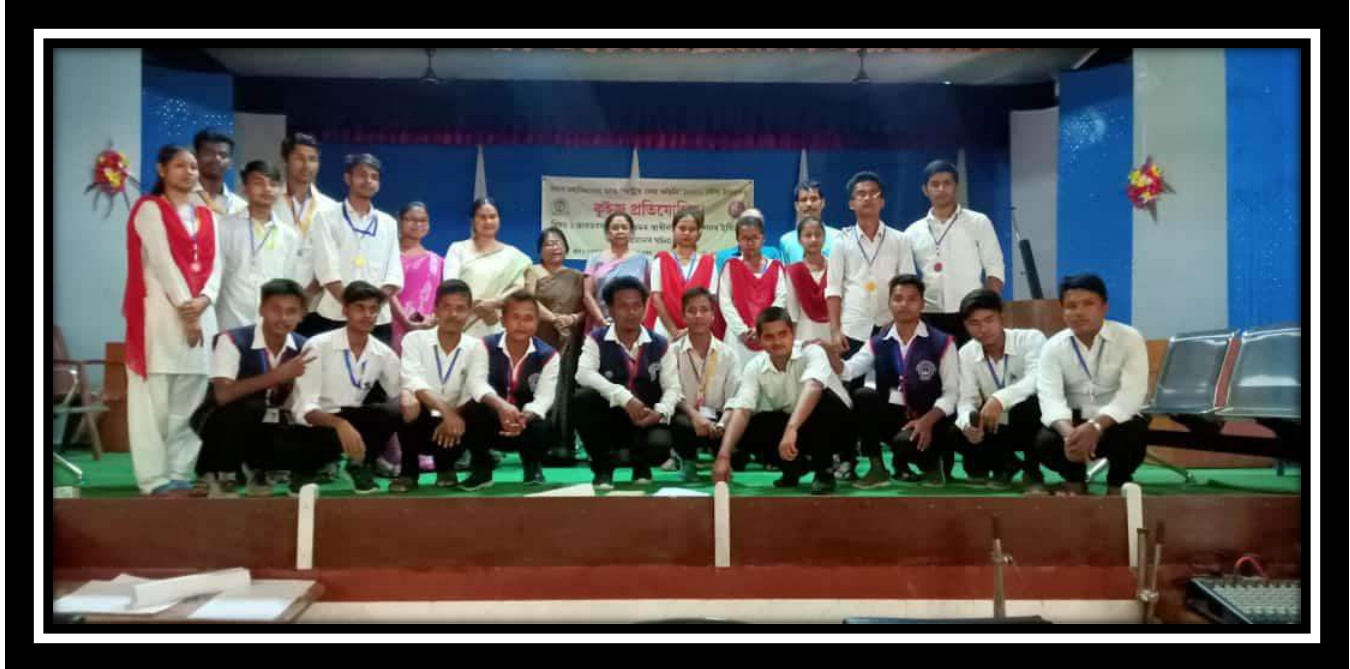
33.Fit India Movement .Live from Delhi on 29.8.2019