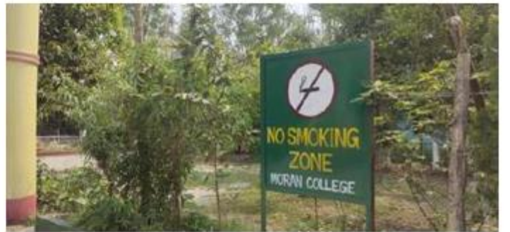
Signboard against smoking