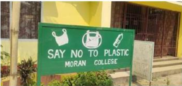
Signboard to make the campus plastic free