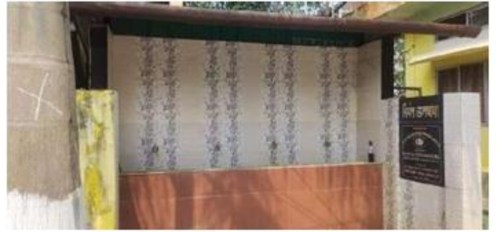
Drinking water taps