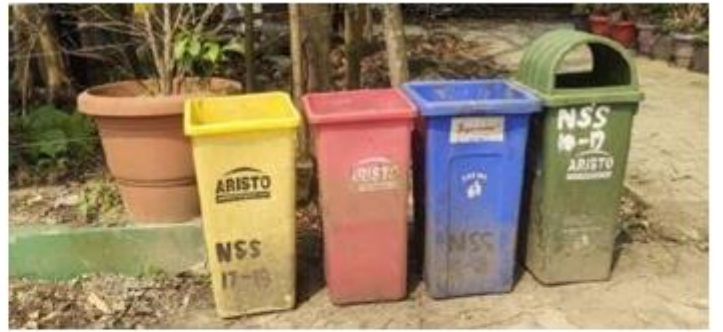
Various types of dustbins in the college campus