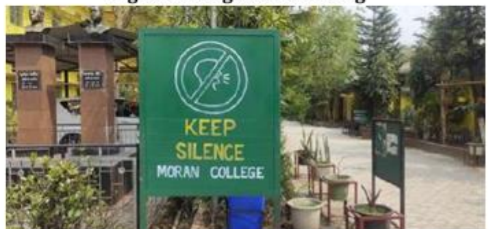
Signboard against noise pollution