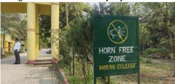
Signboard against noise pollution