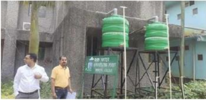
Rain water harvesting system